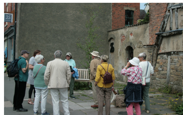
Above: a group pauses at the Cruck Beam.

Would you like to offer a few hours over the year to lead on a talk and/or walk about Wirksworth's history to local and visiting groups? Perhaps you have a specific interest and knowledge about local history you would like to offer as a new 1 hour talk or walk. If so get in touch! Training provided and, as an added bonus, our volunteers are invited to new exhibition openings and volunteer events. Please email info@wirksworthheritagecentre or ask at the