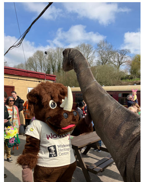
Below: A 'distant fellow creature' met Woolly at Wirksworth Station.