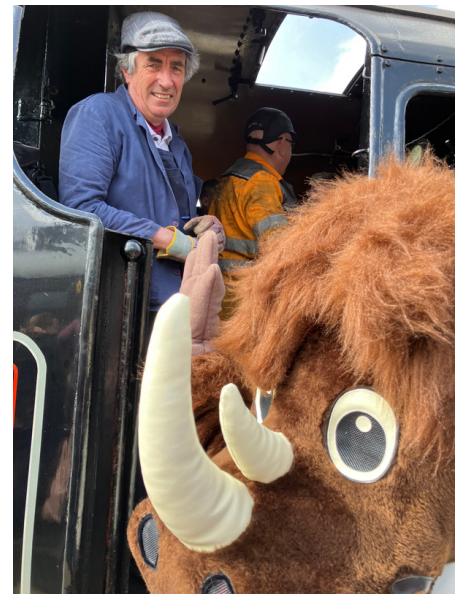
Above: Woolly meets a friendly driver.