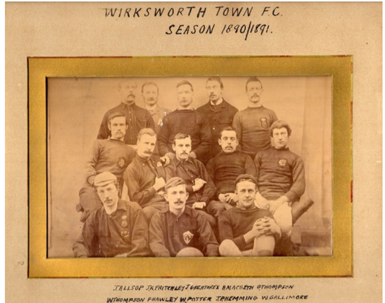
Above: a photo of Wirksworth Town Football Club, dating back to 1891.